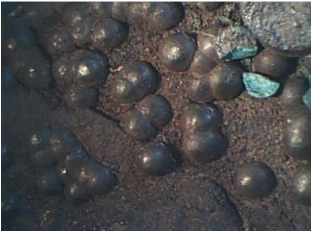
Collomorphic malachite spherulites coated by copper oxides. x20