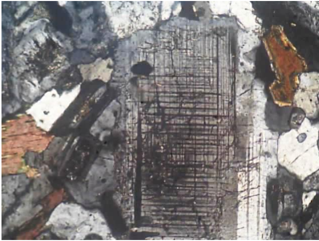
Copper ore. Cristal of microcline (potassium feldspar) with a crosshatched crystal twinning. Polished section. Nicol +, x200