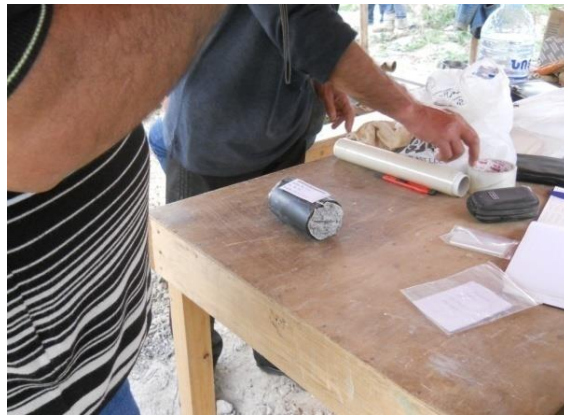
Packing a sample by a plastic half-tube.